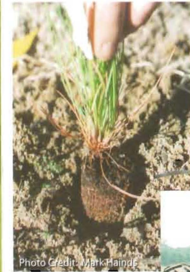
Left: When hand-planting containerized longleaf pine, it is best to keep the plug slightly exposed.

3) If the March-April treatment was missed altogether, consider applying an Arsenal® 4-5 oz / Oust® 2 oz tank mix after May 1st.