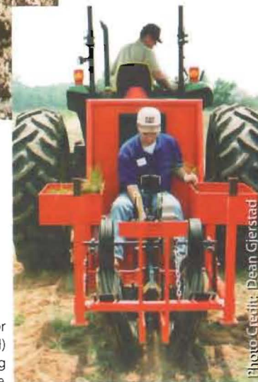
Right: Machine-planting (or using a planting shovel) ensures success when planting bareroot longleaf pine.